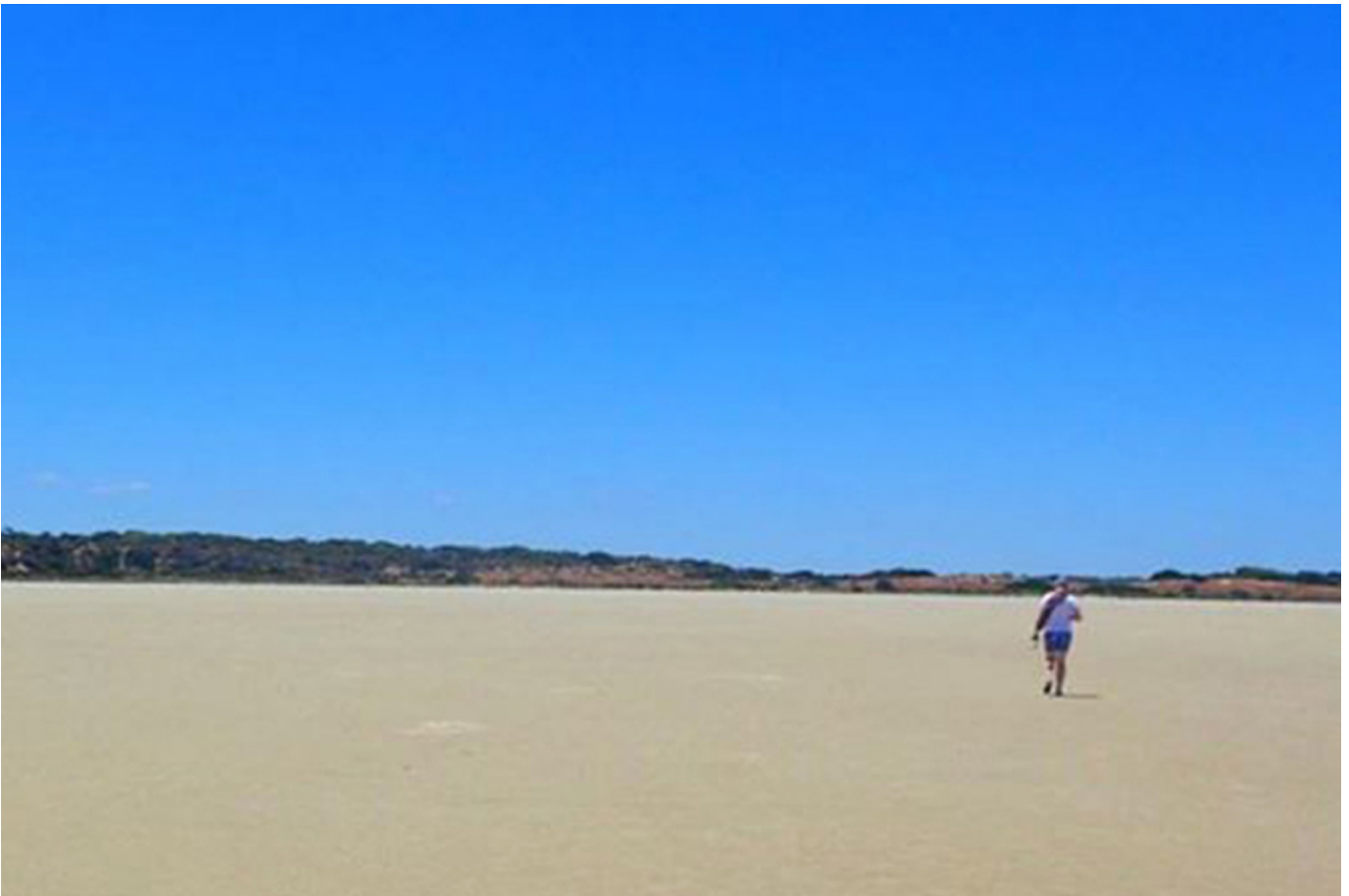
Walking the sand flat between Bluff Island and the 'mainland' at Parnka Point, Coorong National Park, South Australia