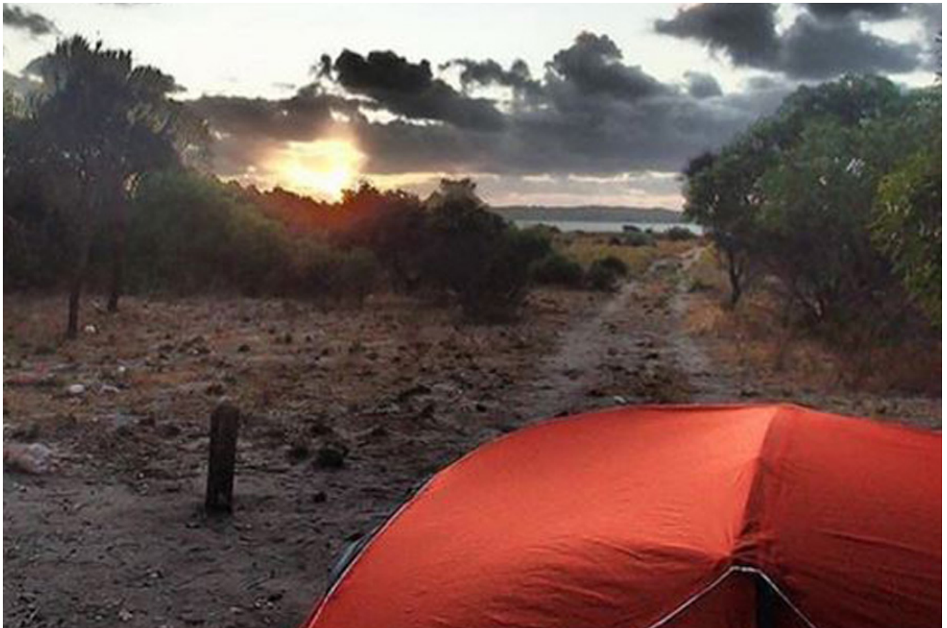
Camping at the Avocet campground at Parnka Point, Coorong National Park, South Australia.