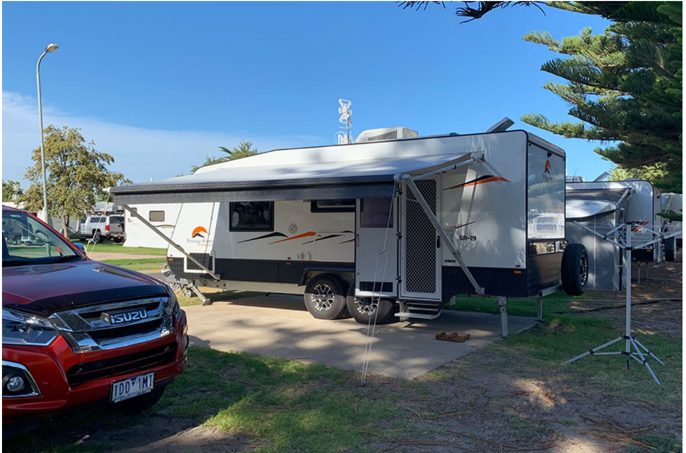
An awning is just one of the accessories you can purchase for your caravan.

However, while they give protection from above, there is little protection from the side or ends of the awning.